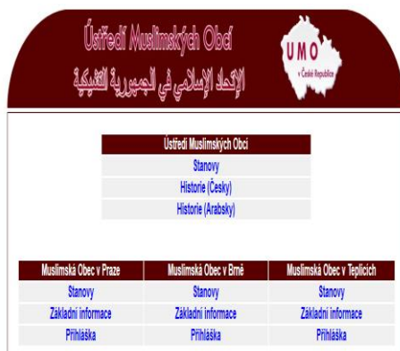
Picture 1: Center for Muslim Communities in the Czech Republic Web Page, http://www.umocr.cz/

But there is another online project connected to the Center - a web page E-islám www.e-islam.cz .